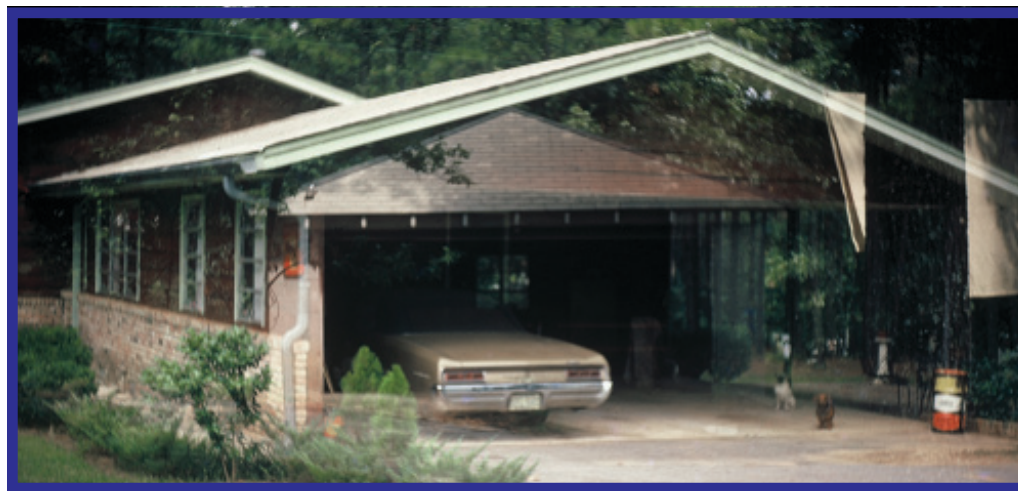
The garage where Carroll Voss started Arrow Adhesives.